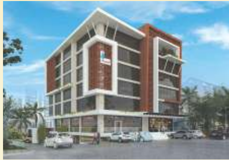
Four Walls Aarambh Premium Commercial Business Centre Bejai - Kapikad, Mangaluru